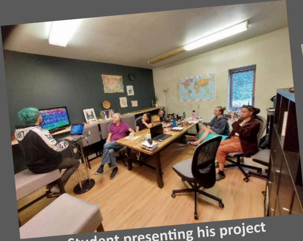
Student presenting his project