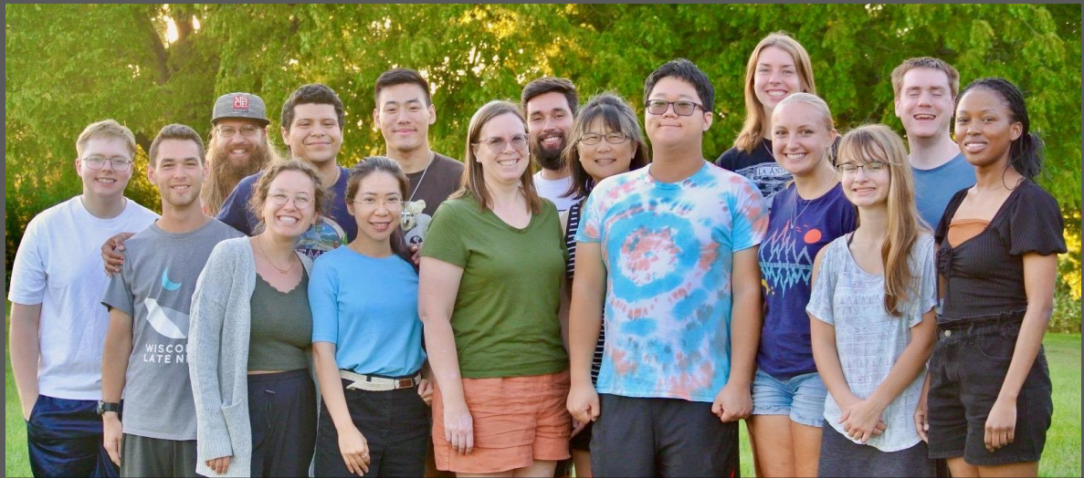
Photo taken at the PHOS Orientation Retreat on Sept 1-3. This academic year, we have 15 students – 2 couldn't join us at the retreat. A new male part-time staff (the bearded guy behind me) has joined us for this semester, PTL!!! We have been & are still praying for more staff – full-time & long-term.

I stayed at the Base for 3 months during the duration of SBCW. I moved back to PHOS on Aug 21. Had a 1 week break but it was only a break from Base activities, not from PHOS ministry. I moved back at the busiest time for PHOS as the new academic year of the University of Wisconsin was starting. We were still processing new applications and enquiries. Finally, we accepted 3 new residents while 2 had left us.