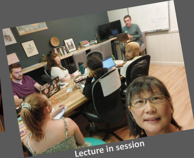
Lecture in session