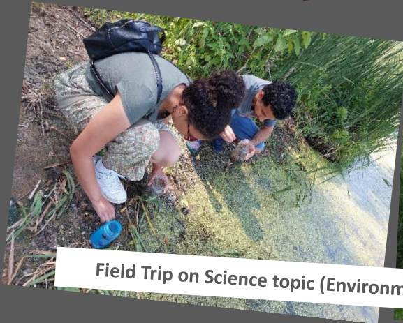
Field Trip on Science topic (Environmental Science)